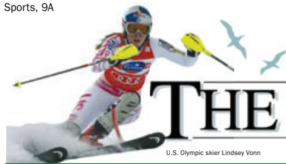
U.S. Olympic skier Lindsey Vonn